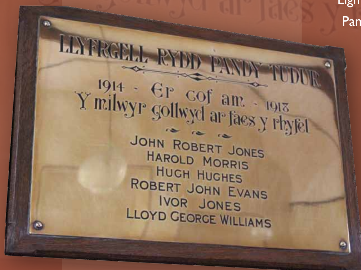
Plac er Cof, Memorial Plaque