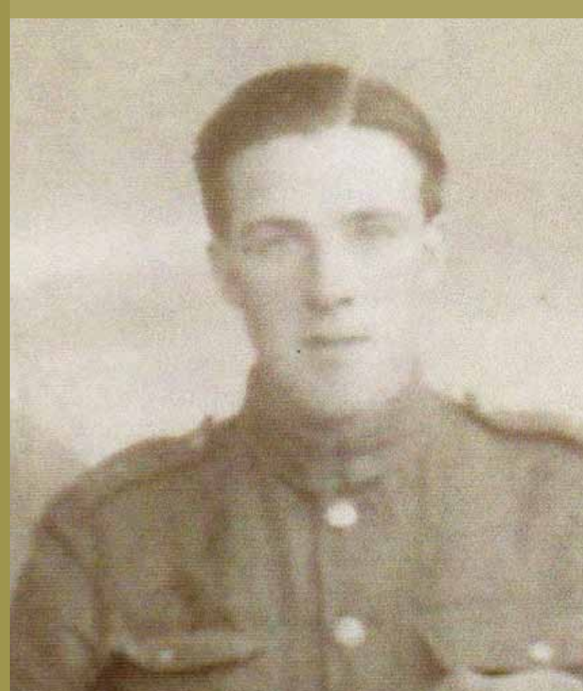
Un o'r Morrisiaid